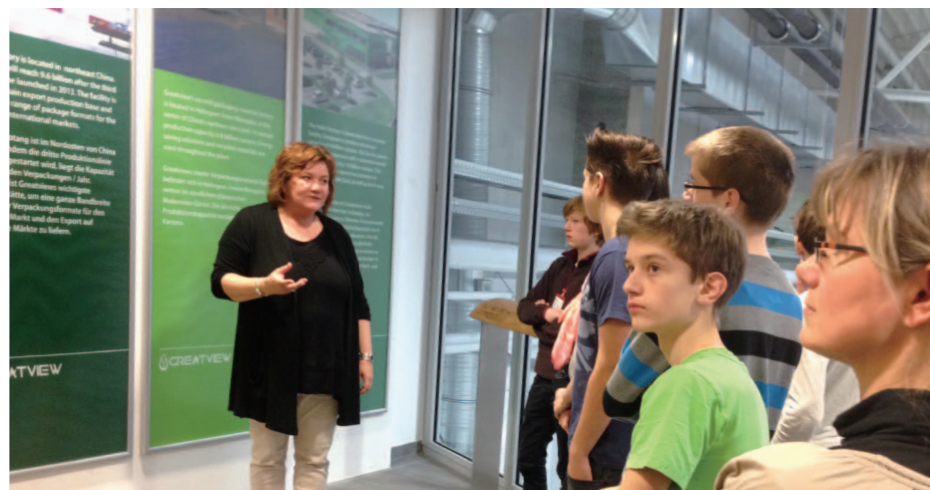
Greatview offers courses in social responsibility for German secondary school students