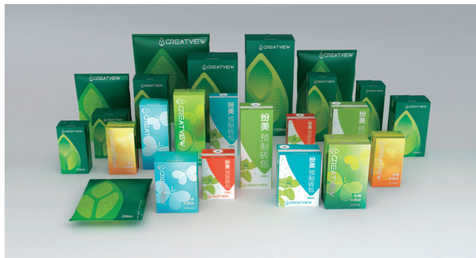
Greatview's complete product portfolio

During the period under review, we continued to implement the enterprise resource planning system by establishing standardized procedures to business functions, which has simplified the operation management of the Company. As we are optimizing and standardizing the business process, we are also expanding the scope to the entire Group to strengthen the centralization of our Group's management functions.