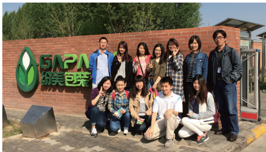
Greatview organizes a social responsibility course for UIBE students at its Inner Mongolia factory

Our distribution expenses decreased by RMB6.0 million, or 11.6%, to RMB45.8 million for the six months ended 30 June 2015 from RMB51.8 million for the six months ended 30 June 2014, primarily due to the decrease in transportation expenses and advertising and promotion expenses. The decrease in distribution expenses was in line with the reduction in sales volume.