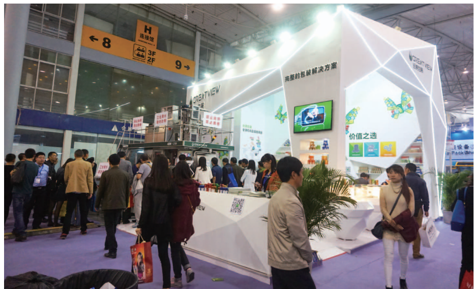
Greatview's exhibit booth at the 92nd China Food & Drinks Fair

In March 2015, we exhibited our entire series of products, including aseptic packaging materials, filling machine and spare parts, at Chengdu's 92nd Food and Drinks Fair, the PRC. This included the unveiling of Greatview's latest aseptic carton range, Greatview Blank-Fed, which enables owners of applicable blank-fed filling machines to choose an alternative carton supplier for their ambient dairy and NCS D products.