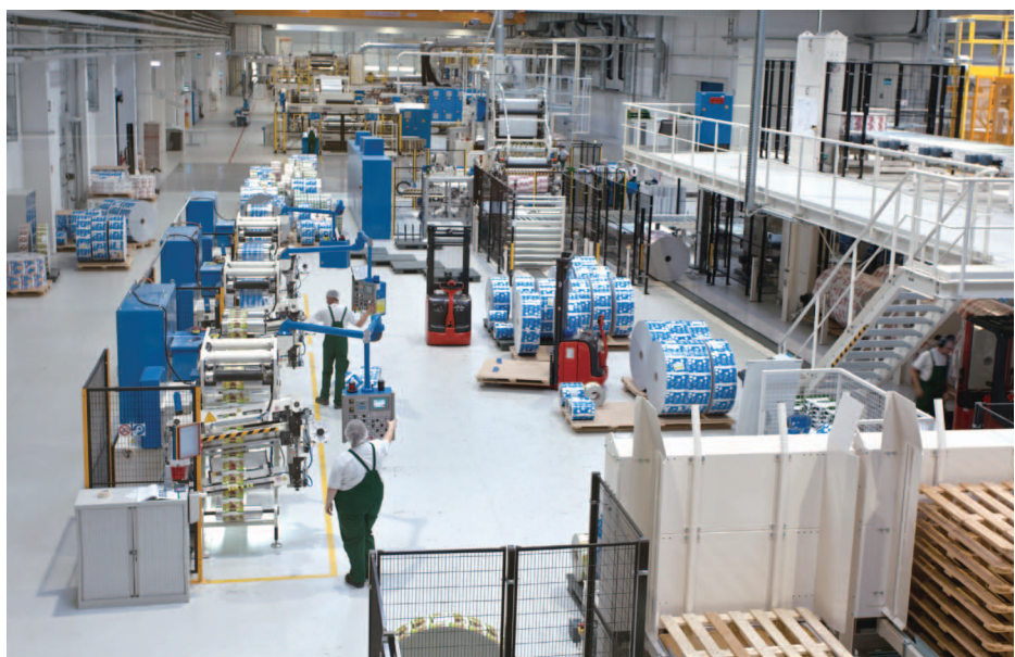
Greatview’s German production factory in Halle, Saale

Although the dairy industry in the PRC is experiencing a slow recovery, we stay positive on the prospects of the sector in long term due to the urbanization and the relative low annual consumption per capita of dairy products in the PRC. In regard to our international business, we believe plenty of opportunities are to be explored to expand our market share.